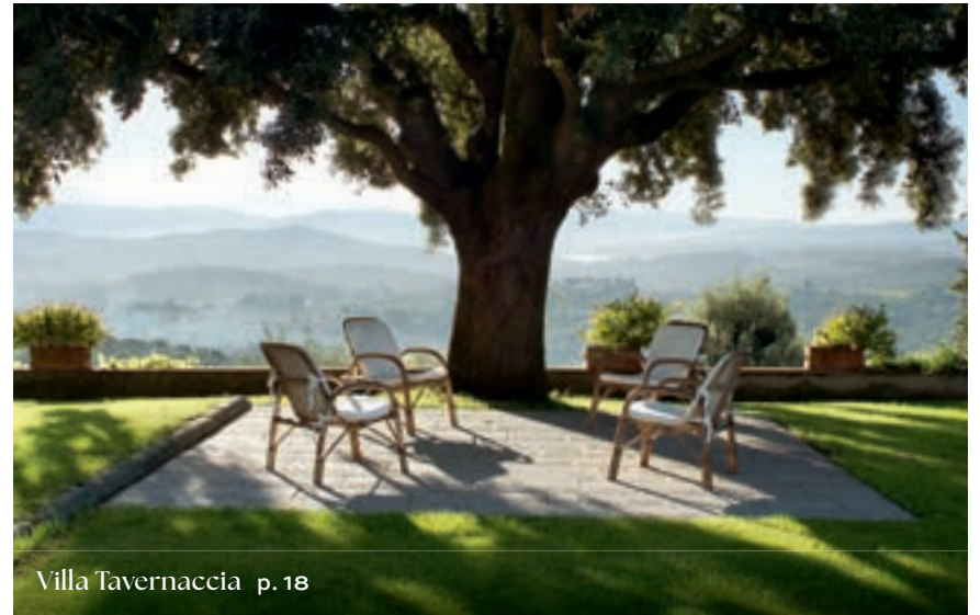
Villa Tavernaccia p. 18