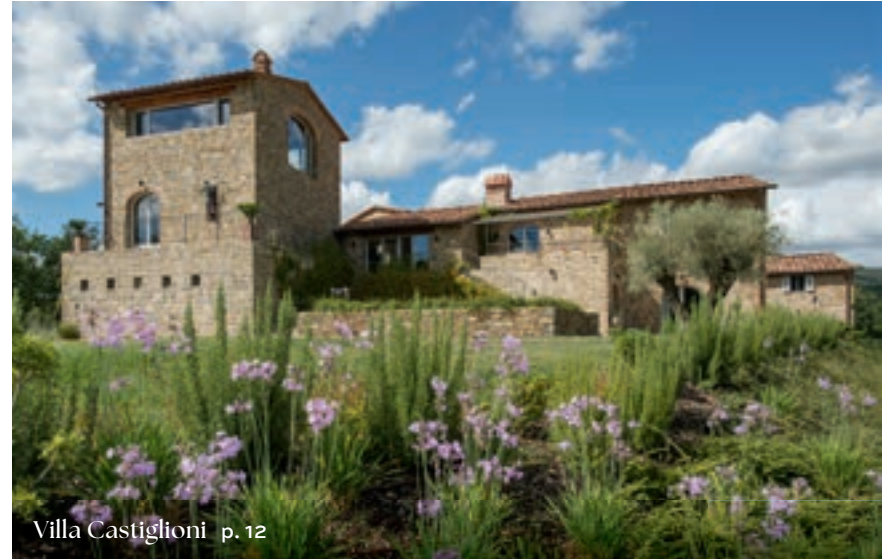
Villa Castiglioni p. 12