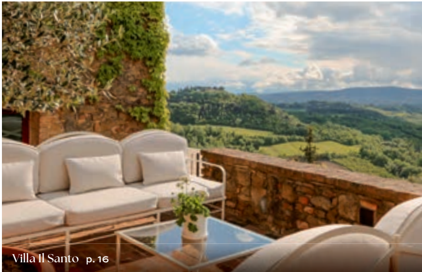
Villa Il Santo p. 16