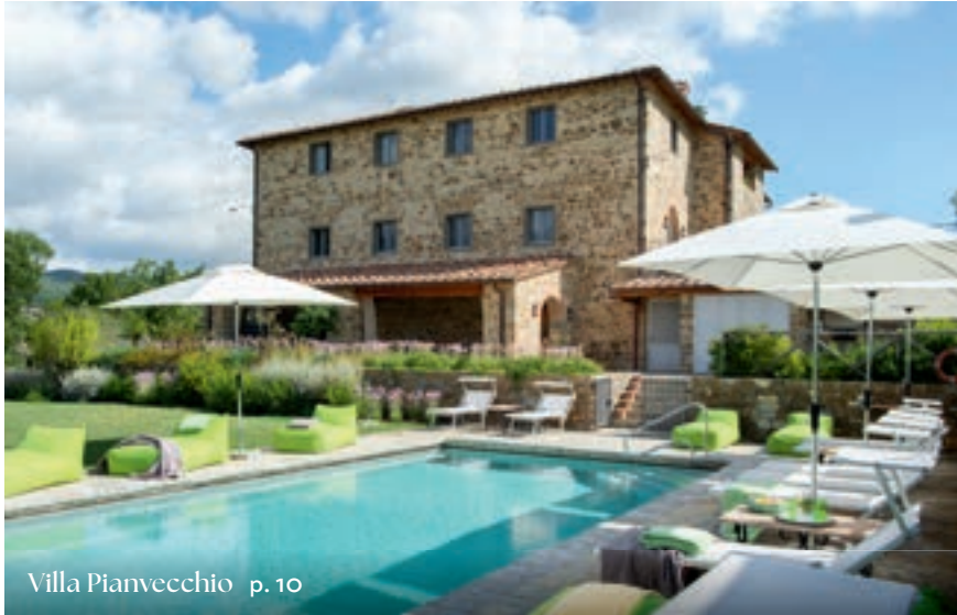
Villa Pianvecchio p. 10