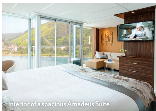
Interior of a spacious Amadeus Suite