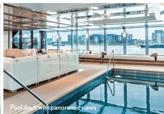
Pool deck with panoramic views